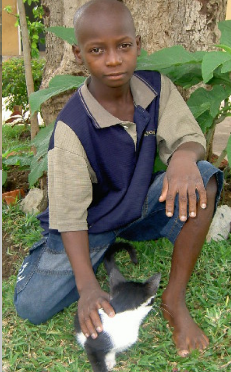
One month later